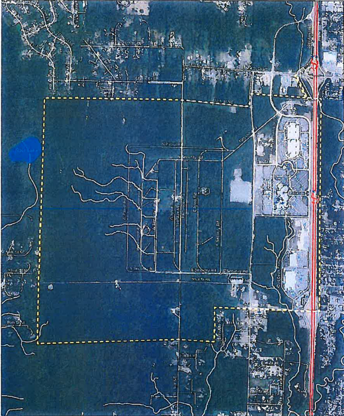
Quil Ceda Village and the Vicinity